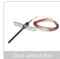
Duct without Box