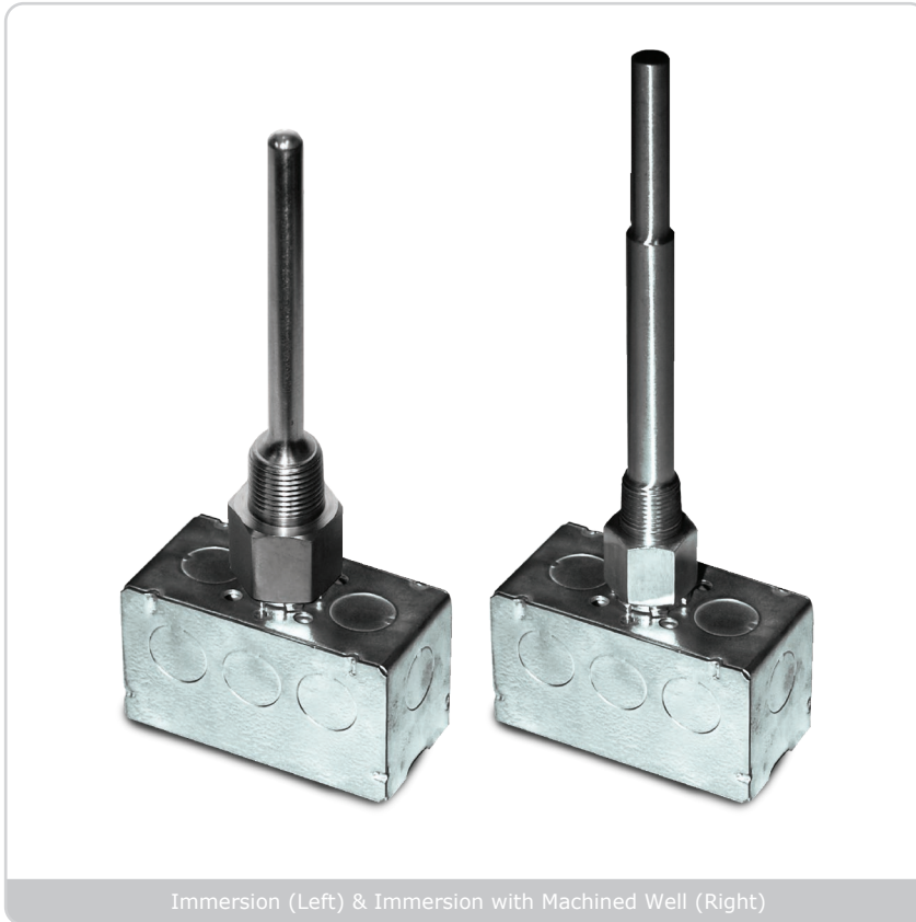
Immersion (Left) & Immersion with Machined Well (Right)